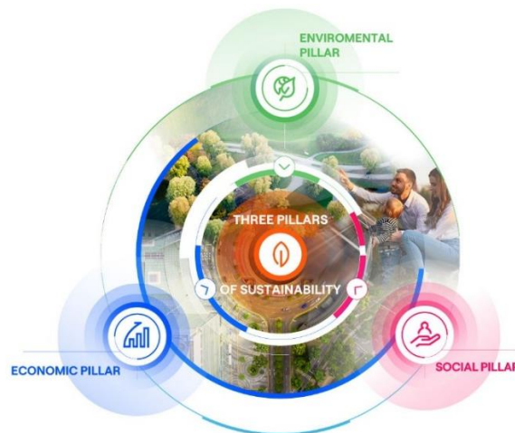
Figure 1: Three (3) pillars of sustainability, Enel Group 3

Sustainable Cultural Tourism on the Mediterranean